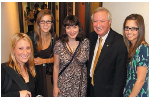
Gables Home Page interns pose with Mayor Don Slesnick